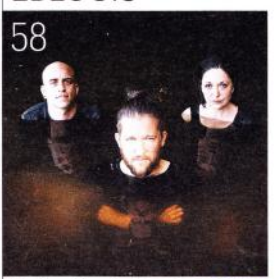
INET fait vibrer ses cordes au diapason de la nature et de la vie.