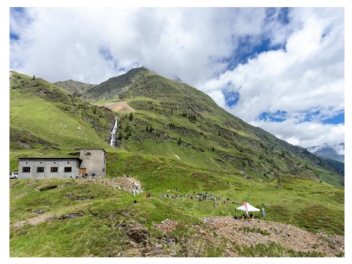
Dat dezelfde band als gisteren in het bos dan op die plek speelt is jammer, maar maakt tegelijkertijd ook niet uit. De muziek van La Litanies des Cimes klonk gisteren in het bos al prachtig en klinkt nu in deze door de zon en wolken steeds weer veranderende natuur al net zo mooi of zelfs nog bijzonderder. Een concert in deze prachtige en zeer bijzondere omgeving kan dan ook gewoon niet mis gaan.