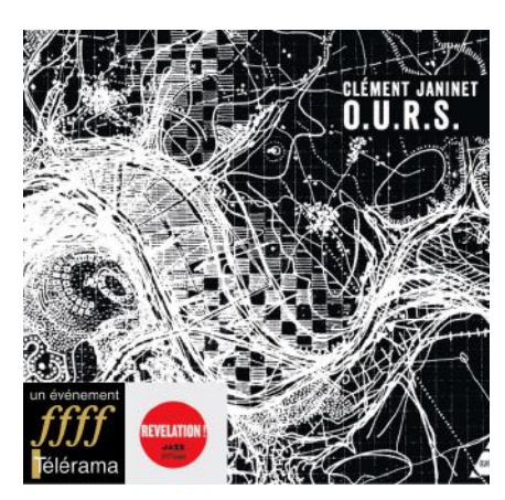
O.U.R.S Gigantonium (2018)